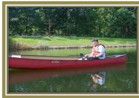
Official Camp Page www.facebook.com/campjoota